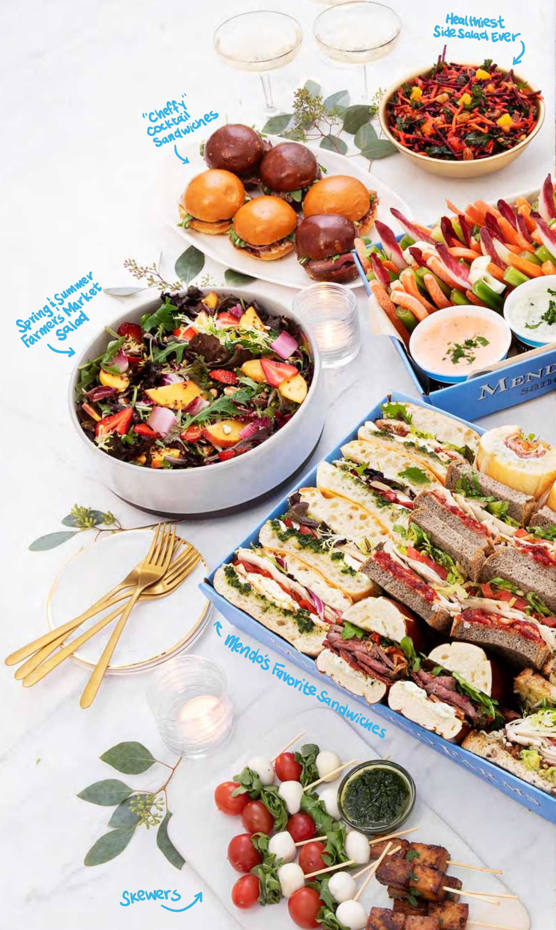
Spring & Summer Farmers Market Salad

BRIDAL AND BABY SHOWER • BIRTHDAY • HOLIDAY SOIRÉE • CELEBRATION OF LIFE